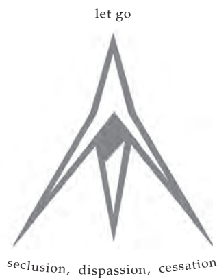
Fig. 11.4 Essential aspects of the cultivation of the awakening factors

These three could be visualized as the three legs of a tripod. On being supported by these three legs, “letting go” or “relinquishment” comes into its proper place, since these three ensure that the letting go is of the appropriate type. So the resultant picture could look somewhat like Figure 11.4.